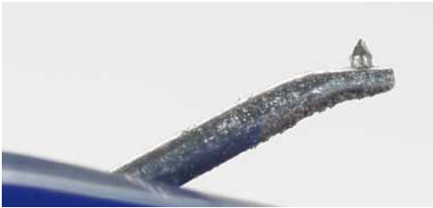
The JT-80LB has an aluminum cantilever with a „joined“ diamond on top.

voltage of the BK is closer to the lower edge of the usual values for MMs; which, however, is not a problem for most phono pres.